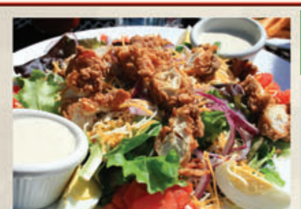
FRIED CHICKEN SALAD