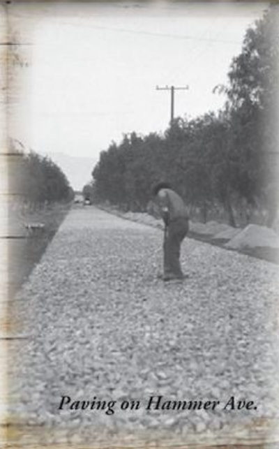
Paving on Hammer Ave.

Our Homemade Biscuits and Homemade Country Gravy served with Hash Browns OR Home Fries 12.89-Half or 13.89-Full