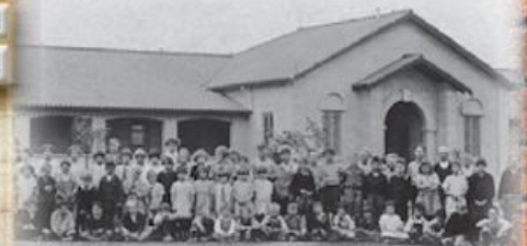
The Community Center on Hammer Ave

All Burgers "N More & "Specialty" Sandwiches come with your choice of one side: French Fries, Onion Rings, Sweet Potato Fries, Potato Salad, Macaroni Salad, Coleslaw, Fresh Fruit, Peaches, Cottage Cheese, Tomato Slices, Cup of Soup, Side Salad. Seasoned or Ranch Seasoned Fries are available at no extra charge. Add Avocado 3.59 Add Cheese 2.09 (American, Swiss, Cheddar or Pepper Jack)