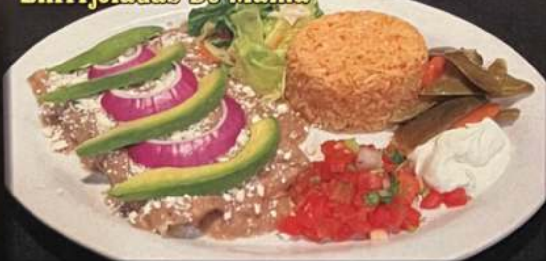
Enfrioladas De Mama

Tender pieces of marinated pork simmered in citrus juices, and served with warm tortillas- 18.99