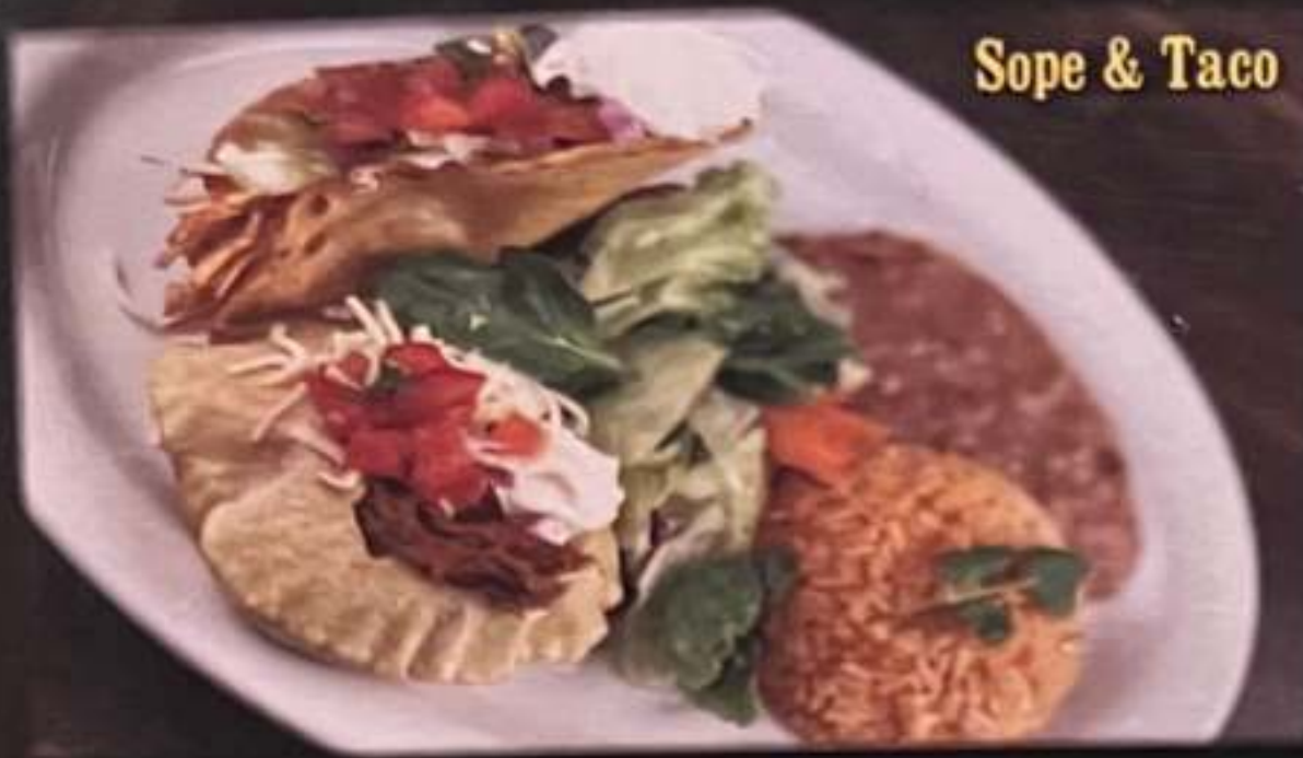
Sope & Taco