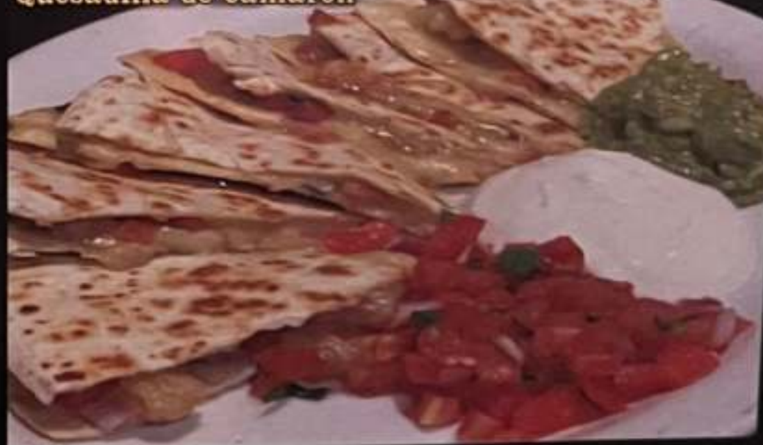
Quesadilla de Camaron

Filled with shrimp sautéed in a garlic butter tomatillo salsa- 19.99