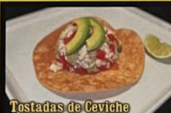
Tostadas de Ceviche