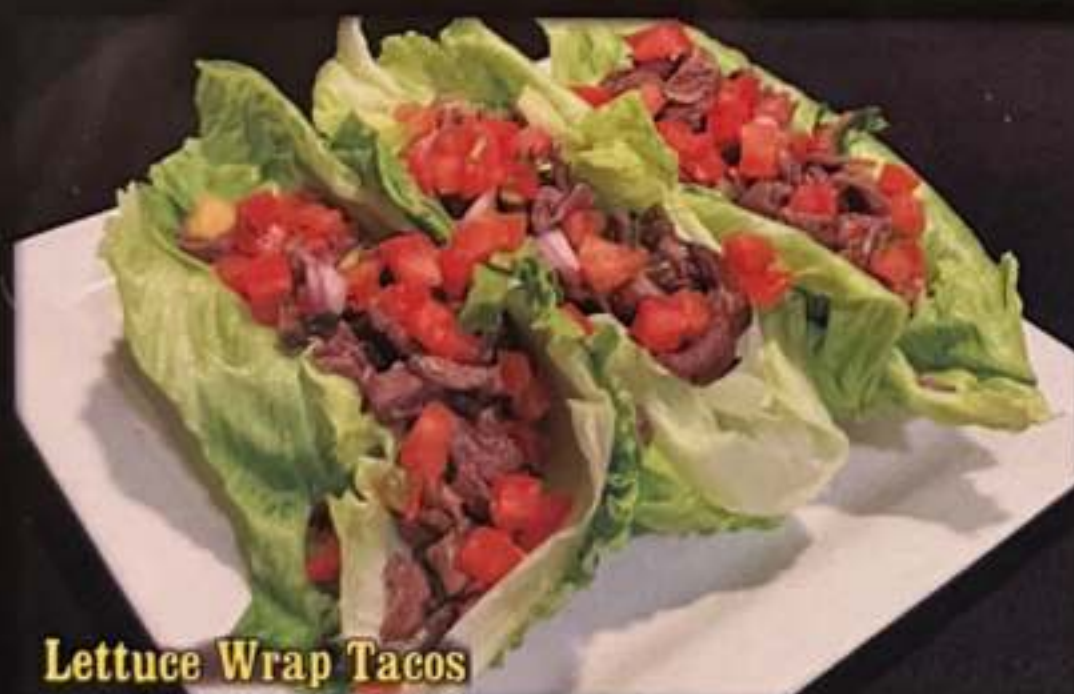
Lettuce Wrap Tacos