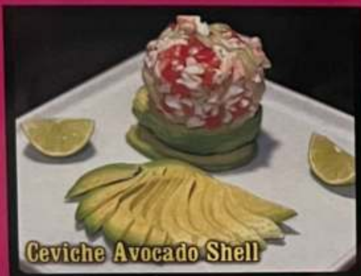
Ceviche Avocado Shell

Shrimp stuffed with cheese and chorizo wrapped with bacon and teriyaki sauce- 21.99