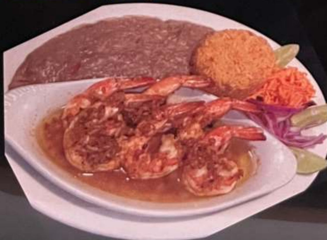
Camarones al Mojo de Ajo

Stuffed with cheese, chorizo and wrapped with bacon - 24.99