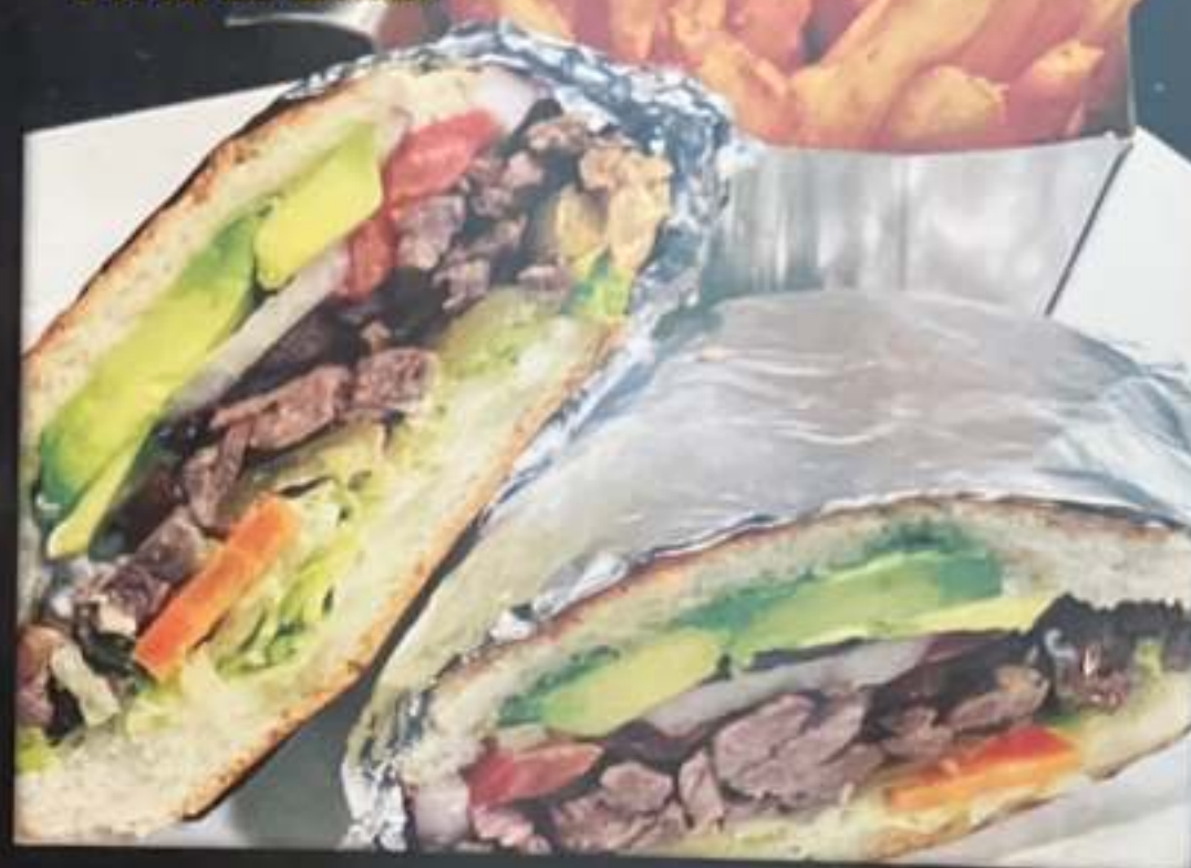
Torta de Asada