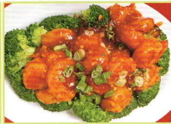
Sweet Pungent Shrimp