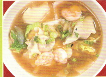
Wor Wonton Soup