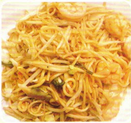
Shrimp Low Mein