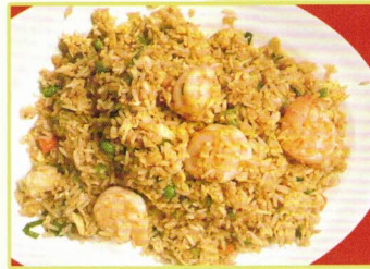
Shrimp Fried Rice