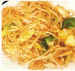
Chop Suey Deluxe