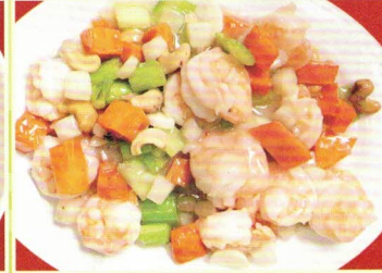
Shrimp with Cashew Nuts