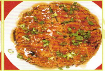
Egg Foo Young