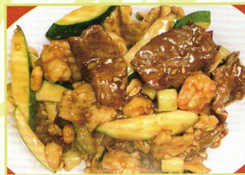
Kun-Pao Three Shreds