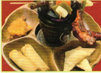
Assorted Appetizer Tray