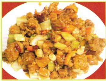
Beef with Orange Peel Sauce