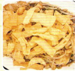
Deluxe Chow Mein