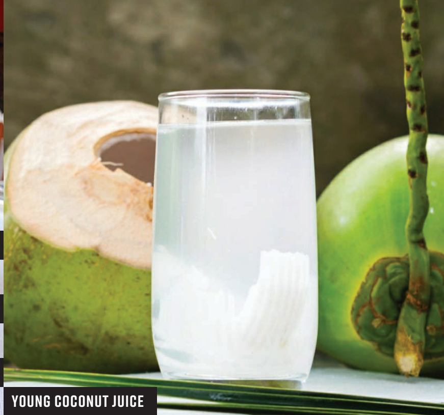
YOUNG COCONUT JUICE