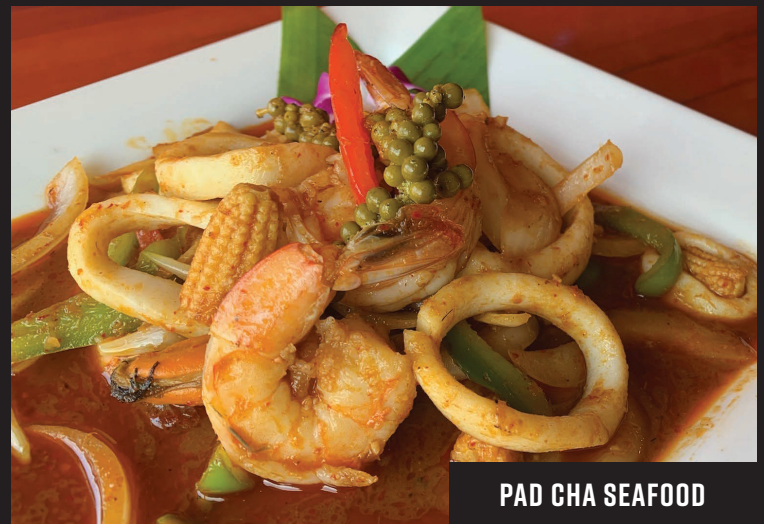
PAD CHA SEAFOOD