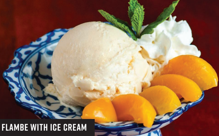
PEACH FLAMBE WITH ICE CREAM