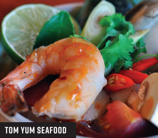
TOM YUM SEAFOOD