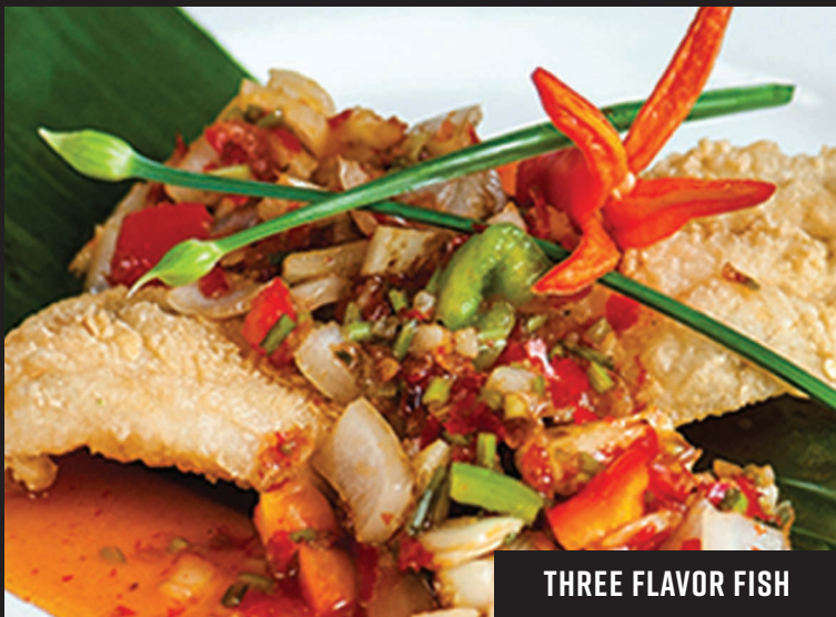
THREE FLAVOR FISH