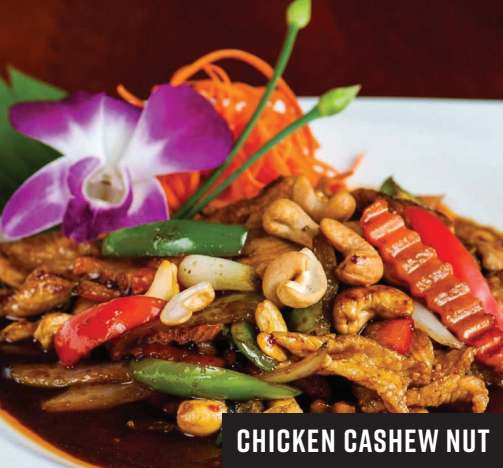
CHICKEN CASHEW NUT