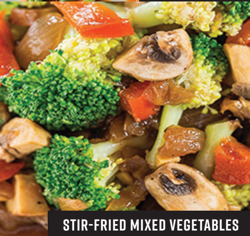
STIR-FRIED MIXED VEGETABLES