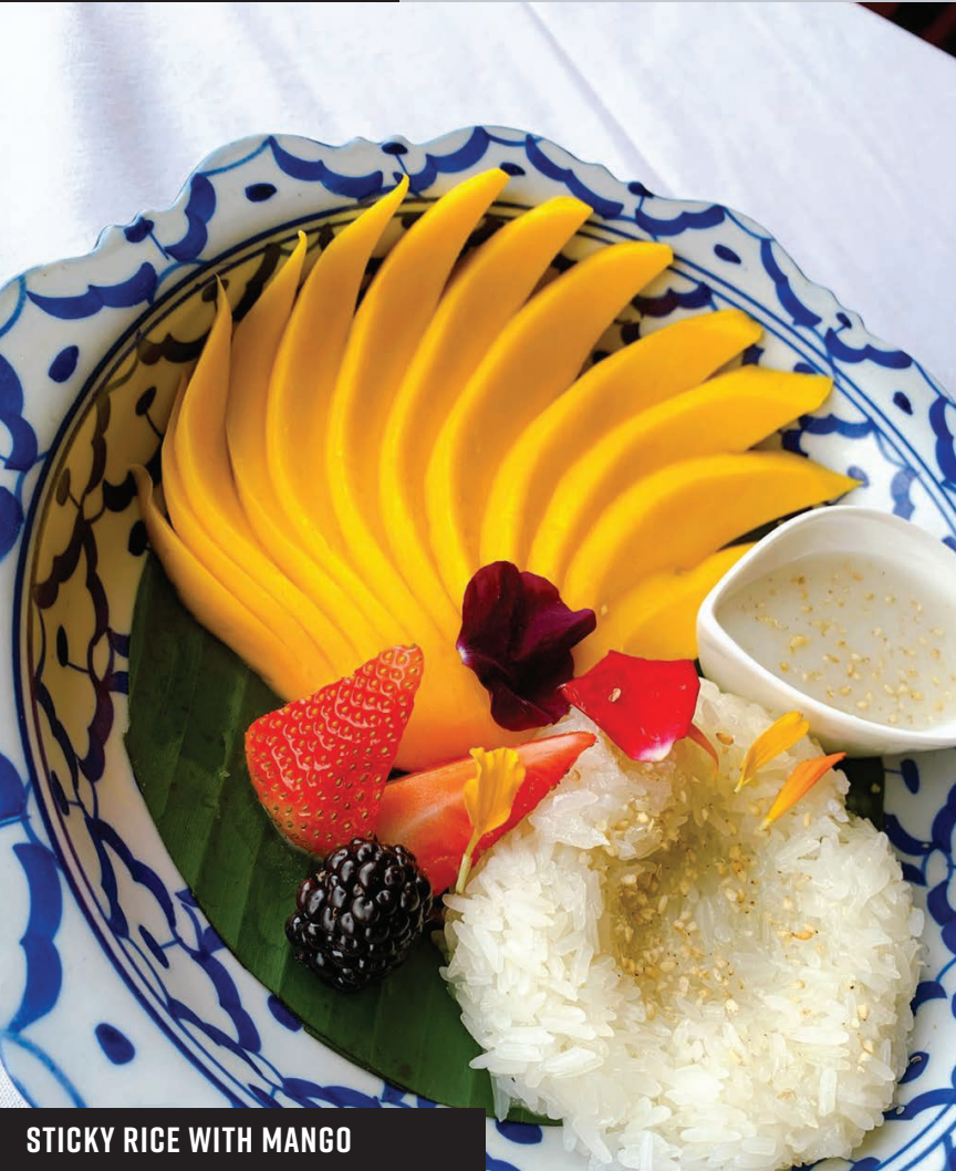
STICKY RICE WITH MANGO