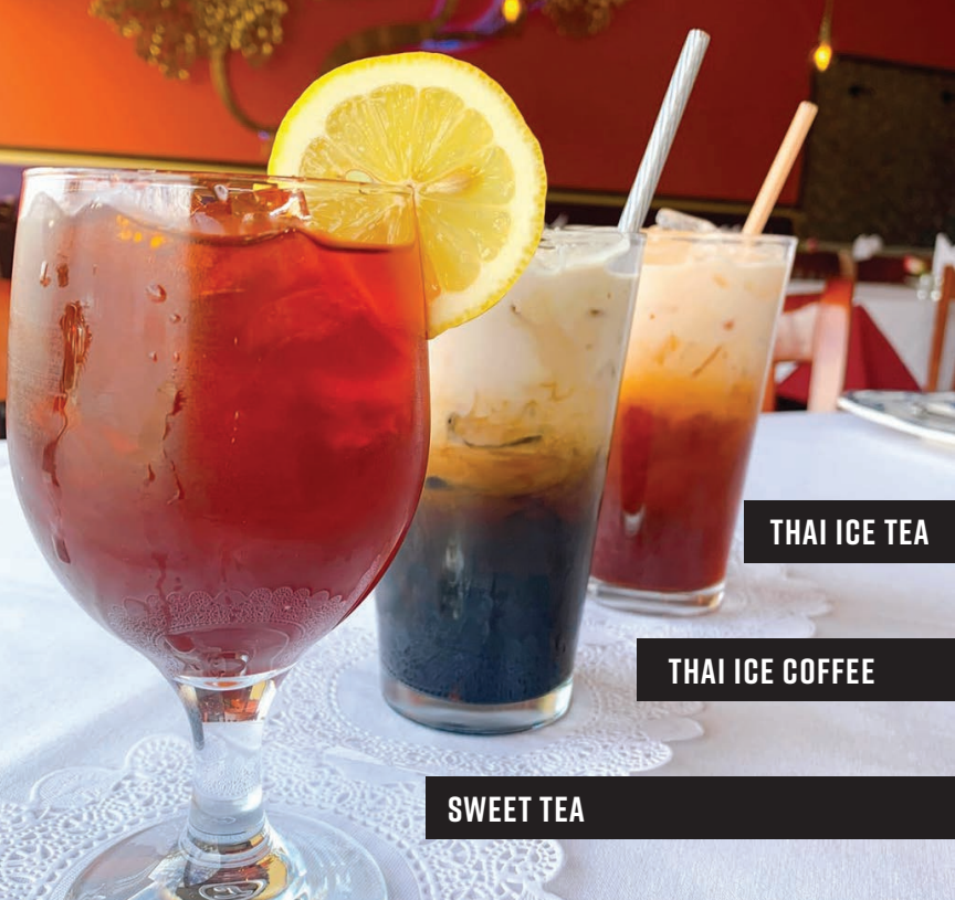
THAI ICE TEA