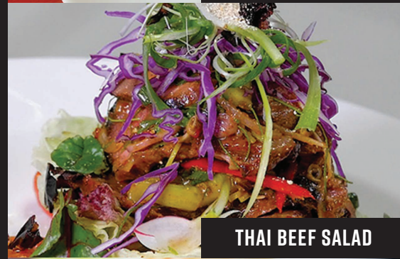
THAI BEEF SALAD