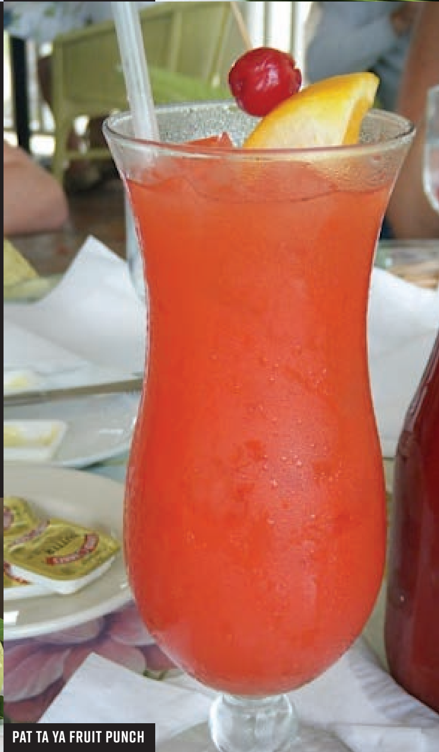
PAT TA YA FRUIT PUNCH