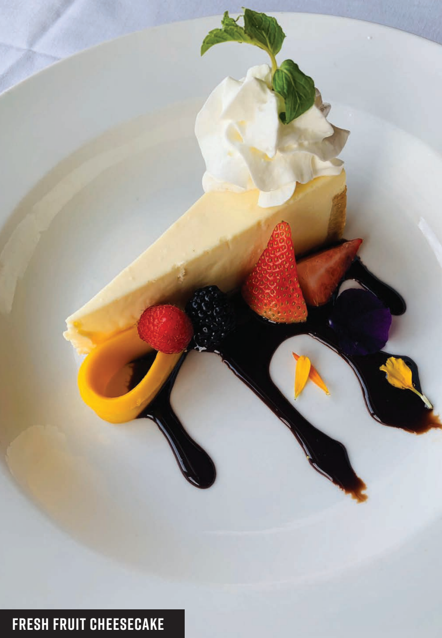
FRESH FRUIT CHEESECAKE