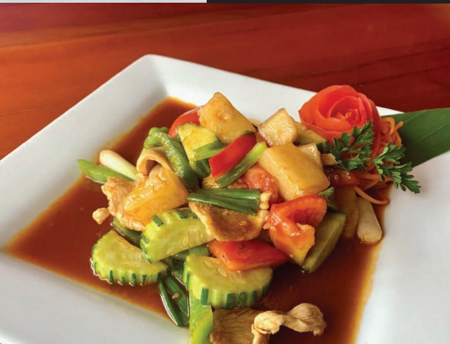
STIR-FRIED SWEET AND SOUR CHICKEN