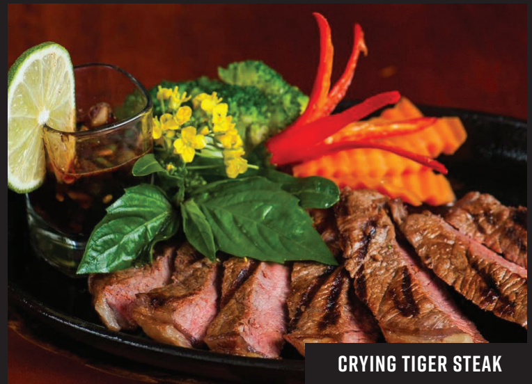
CRYING TIGER STEAK

PLEASE INDICATE YOUR SENSE OF ADVENTURE: MILD, MEDIUM, HOT OR THAI HOT