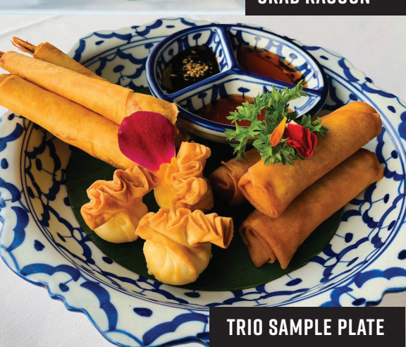
TRIO SAMPLE PLATE