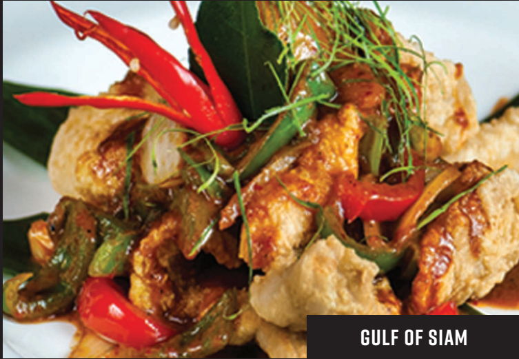
GULF OF SIAM

GULF OF SIAM..... 20.95 Shrimp, fish, calamari and mussels stir-fried in our magnificent sauce