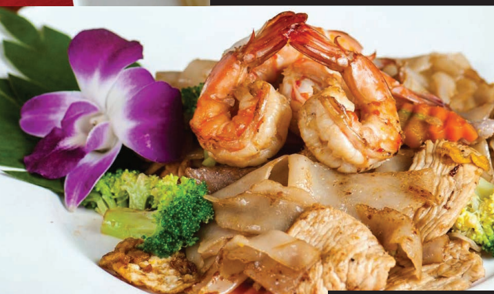
PAD SEE EEW

PAD THAI Traditional rice noodles with egg, bean sprouts, green onions, fried tofu, carrots and chopped peanuts