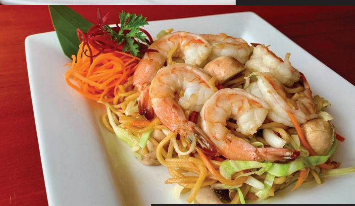
LO MEIN NOODLES WITH SHRIMP

PLEASE SPECIFY YOUR CHOICE OF MEAT: CHICKEN, BEEF, PORK, TOFU OR VEGETABLES.....13.95 SHRIMP.....15.95