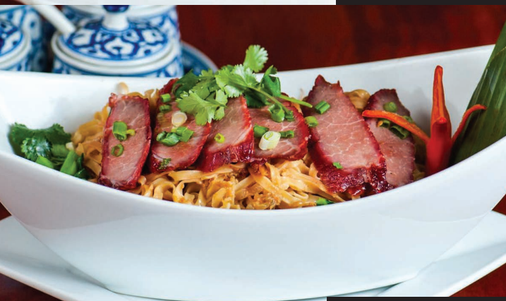
BBQ STREET NOODLE

LARD NAH Stir-fried flat rice noodles in bean paste gravy with egg and broccoli