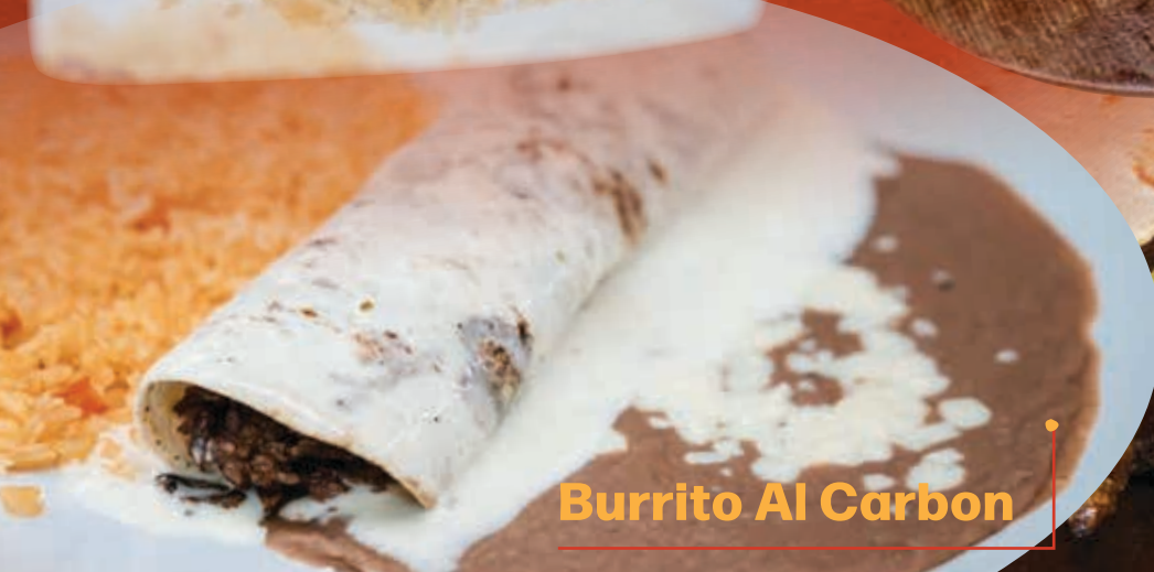
Burrito Al Carbon