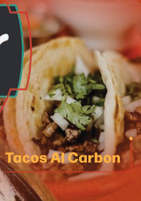
Tacos Al Carbon