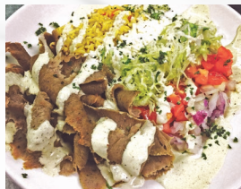
Gyro & Feta Bowl