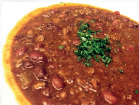
Vegetable Lentil (Faki)