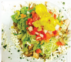
Chicken & Feta Bowl