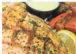
Salmon "Wild -Caught"

A generous portion of chicken, marinated with Greek spices and chargrilled with red peppers, green peppers, and red onions set on a bed of Greek country rice with a side of our famous Greek dressing.