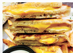
Kids Grilled Cheese Pita with Fresh Cut Fries