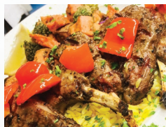
Pappou's Lamb Chops