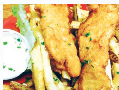
Kid's Chicken Dippers with Fresh Cut Fries