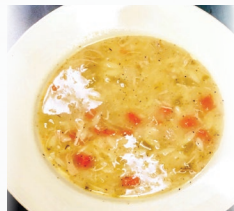
Chicken Lemon (Avgolemono)