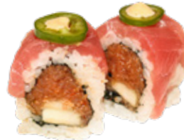
T&T (8pcs) $14.99 In: extra sp.tuna, cucumber Out: tuna, jalapeno Sauce: sp. T&T sauce