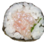
Yellowtail (6pcs) $8.99