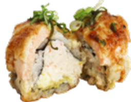
Baked Salmon (8pcs) $14.99 In: imitation crab, cream cheese, avocado Out: salmon Sauce: eel sauce