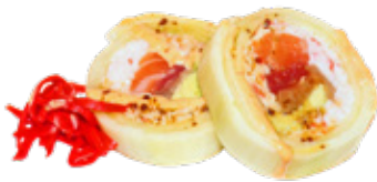
Sexy (6pcs) $15.99 In: salmon, tuna, imitation crab, avocado, albacore Out: cucumber Sauce: sp. mayo, creamy sesame dressing