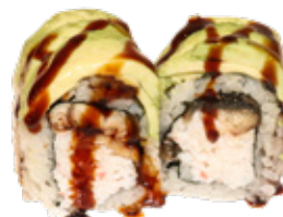
Caterpillar (8pcs) $14.99 In: eel, imitation crab Out: avocado Sauce: eel sauce