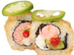
Blooming (8pcs) $15.99 In: salmon, cream cheese, avo. Out: deep fried, jalapeno Sauce: sp. mayo, eel sauce