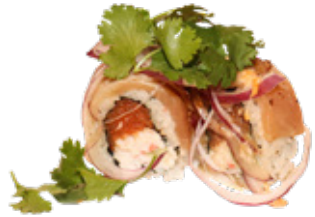
Amigo (8pcs) $15.99 In: sp.tuna, imitation crab, cucumber Out: albacore, onion, cilantro Sauce: soy mustard