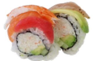
Rainbow (8pcs) $13.99 In: cali roll Out: tuna, salmon, albacore, shrimp, avocado