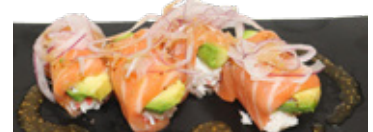
Salmon Delight (4pcs) $15.99