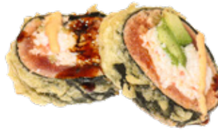
Samba (6pcs) $12.99 In: imitation crab, sp. tuna, avocado, Out: deep fried Sauce: sp. mayo, eel sauce