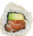
Salmon Avocado (8pcs) $9.99