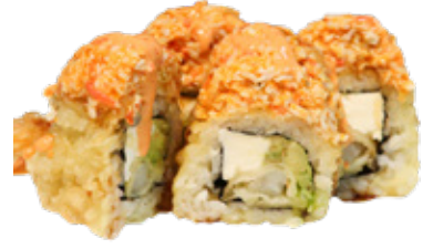
Angel's (9pcs) $13.99 In: shrimp temp. roll, cream cheese, avocado (deep fried together) Out: sp. imitation crab Sauce: sp. mayo, eel sauce