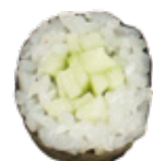
Cucumber (8pcs) $5.99