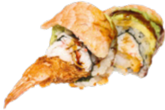
Tiger (8pcs) $13.99 In: imitation crab, shrimp temp. Out: shrimp, avocado Sauce: eel sauce