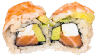
Playboy (8pcs) $14.99 In: salmon, avocado, cream cheese Out: shrimp, avocado Sauce: sp. garlic ponzu