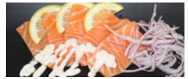
Salmon Carpaccio (5pcs) $16.99