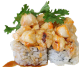
Baked Scallop (8pcs) $14.99 In: cali roll Out: crab, onion, scallop, smelt egg Sauce: eel sauce