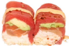
Red Blossom (8pcs) $16.99 In: salmon, avocado, albacore, imitation crab Out: tuna Sauce: sp. mayo, soy wasabi dressing