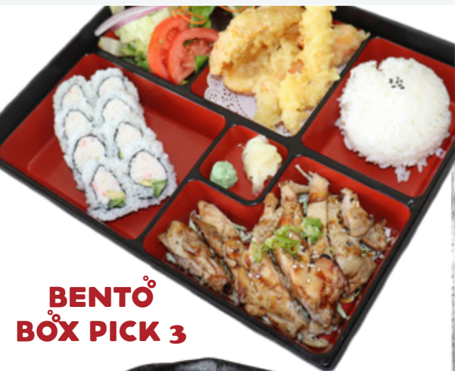
BENTÔ BOX PICK 3