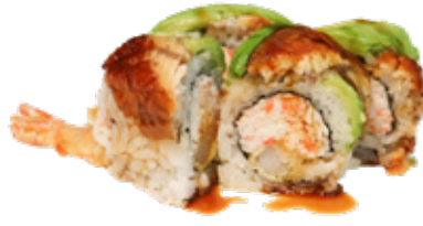
Rattlesnake (8pcs) $15.99 In: imitation crab, shrimp temp. Out: eel, avocado Sauce: eel sauce