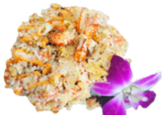
Disney (8pcs) $16.99 In: cali roll Out: crawfish, imitation crab, onion (all mixed & baked) Sauce: sp. mayo, eel sauce, special miso dressing