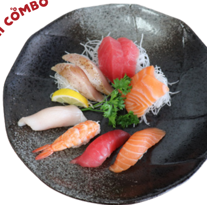
SUSHI & SASHIMI CÔMBÔ