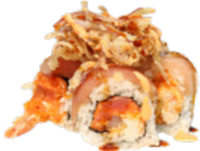
Albacore Special (8pcs) $15.99 In: imitation crab, sp. tuna, shrimp temp. Out: albacore, crunchy onion Sauce: sp. mayo, eel sauce