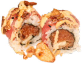
Cajun Sp. Tuna (8pcs) $15.99 In: sp. tuna, cucumber Out: tuna, cajun seasoning, garlic Sauce: sp. mayo