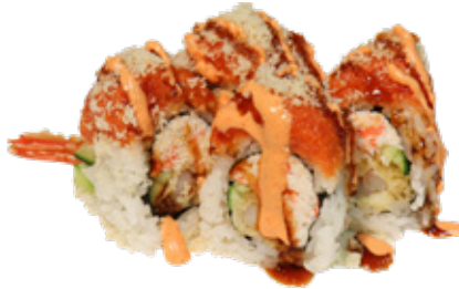
Hot Night (8pcs) $13.99 In: imitation crab, avocado, shrimp temp. Out: sp. tuna, temp. flakes Sauce: sp. mayo, eel sauce