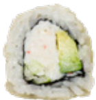
California (8pcs) $5.99