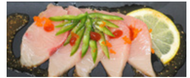
Yellowtail Carpaccio (5pcs) $17.99