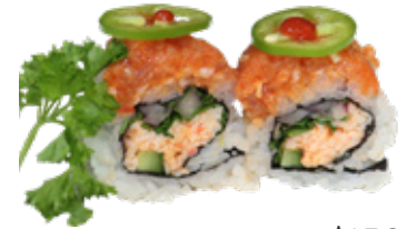
Fuego (8pcs) $15.99 In: red onion, cilantro, sp. crab Out: sp. albacore, jalapeno Sauce: sp. mayo