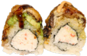
Dragon (8pcs) $14.99 In: cali roll Out: eel, avocado Sauce: eel sauce