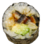
Eel & Avocado (6pcs) $9.99