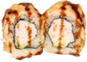
Golden Sun (8pcs) $13.99 In: imitation crab, avocado Out: deep fried salmon Sauce: eel sauce