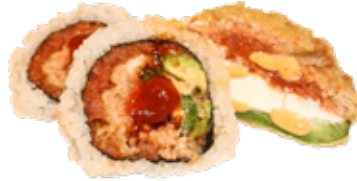
Main St. (6pcs) $14.99 In: jalapeno, cream cheese, sp. tuna, avocado, deep fried Sauce: sp. mayo, eel sauce