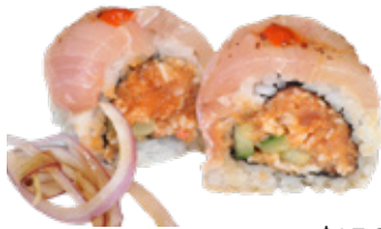
Jun (8pcs) $15.99 In: sp.tuna, imitation crab, cucumber Out: yellowtail, avocado Sauce: sp. ponzu