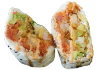
Ironman Burrito $13.99 In: sp. tuna, imitation crab, avocado, shrimp temp. Out: soy bean paper Sauce: sp. mayo, eel sauce