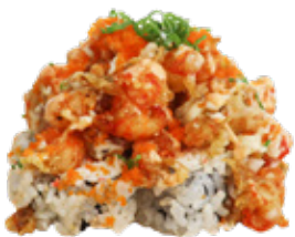
Baked Lobster (8pcs) $16.99 In: cali roll Out: crawfish temp., cheese Sauce: sp. mayo, eel sauce