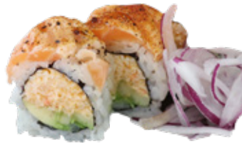
Seared Salmon (8pcs) $15.99 In: sp.crab, cucumber, avocado Out: seared salmon Sauce: ponzu