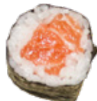
Salmon (6pcs) $7.99