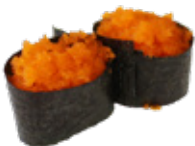
Smelt Roe $5.99