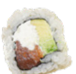
Philadelphia (8pcs) $9.99