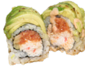
Hulk (8pcs) $13.99 In: sp.tuna, imitation crab, cucumber Out: avocado Sauce: sp. mayo, soy mustard