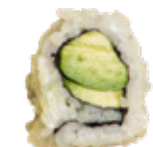
Avocado (8pcs) $6.99