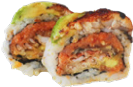
Godzilla (6pcs) $16.99 In: soft shell crab, sp. tuna Out: avocado, eel Sauce: sp. mayo, eel sauce