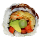
Veggie Tempura (6pcs) $10.99