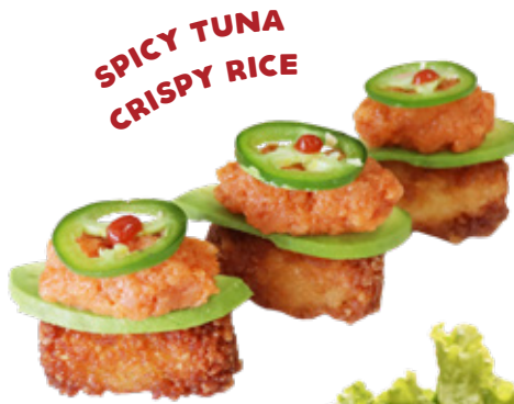
SPICY TUNA CRISPY RICE