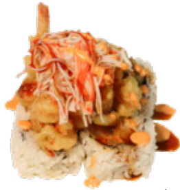
Santa Ana (8pcs) $16.99 In: sp. albacore, shrimp temp. Out: crawfish temp. crab stick Sauce: sp. mayo, eel sauce