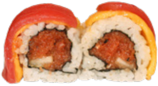
Mango Sp. Tuna (8pcs) $14.99 In: sp.tuna, cucumber Out: tuna, mango Sauce: sp. mayo