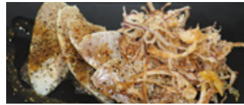
Albacore Carpaccio (5pcs) $16.99