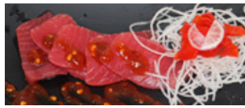
Tuna Carpaccio (5pcs) $16.99