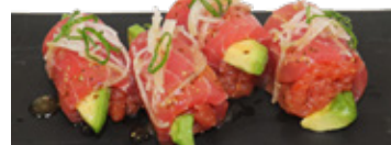
Tuna Delight (4pcs) $15.99