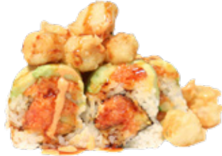
O' Sea (8pcs) $15.99 In: sp. tuna, cucumber Out: avo., sp. tuna, fried scallop Sauce: sp. mayo, eel sauce