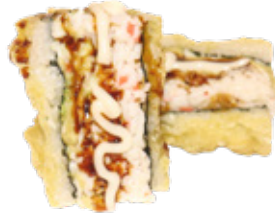
Cali Tempura (8pcs) $10.99 In: imitation crab, avocado Out: deep fried Sauce: baked mayo, eel sauce