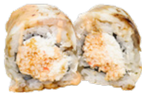
Snow (8pcs) $14.99 In: imitation sp. crab, cream cheese Out: white fish Sauce: sp. mayo, eel sauce