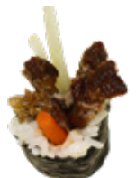
Salmon Skin (6pcs) $7.99