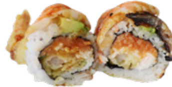
Ji (8pcs) $16.99 In: sp. tuna, imitation crab, shrimp tempura, jalapeno Out: avo., shrimp, eel Sauce: sp. mayo, eel sauce