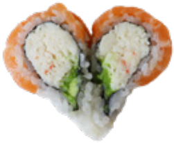
Love (8pcs) $14.99 In: cali roll Out: salmon, red onion Sauce: ponzu