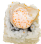
Scallop (6pcs) $7.99