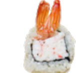
Crab Shrimp (8pcs) $7.99