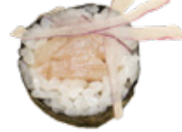
Albacore (6pcs) $7.99