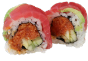
Red Dragon (8pcs) $13.99 In: sp. tuna Out: tuna, avocado