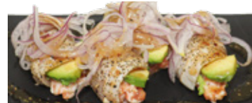
Albacore Delight (4pcs) $15.99