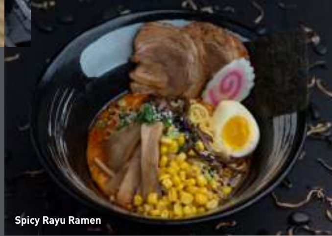
Spicy Rayu Ramen