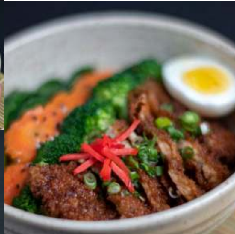
Chicken Rayu Rice Bowl