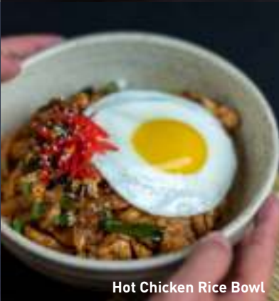
Hot Chicken Rice Bowl