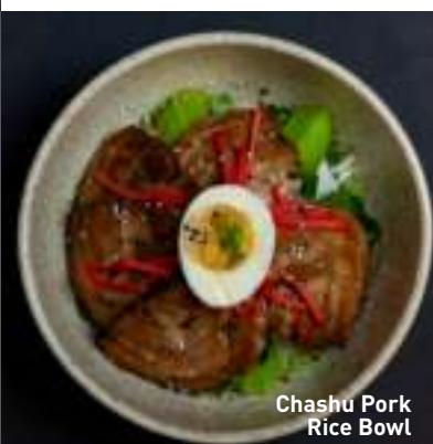
Chashu Pork Rice Bowl