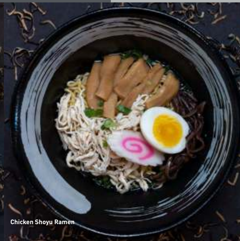
Chicken Shoyu Ramen