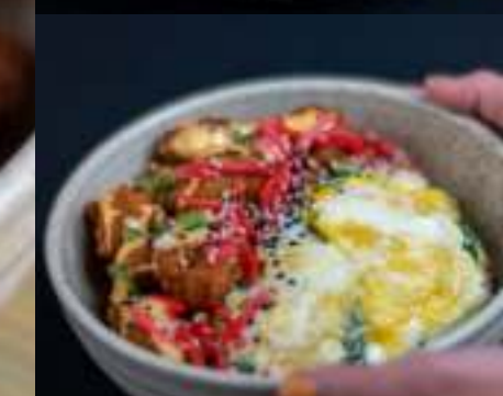
Chicken Karaage Rice Bowl