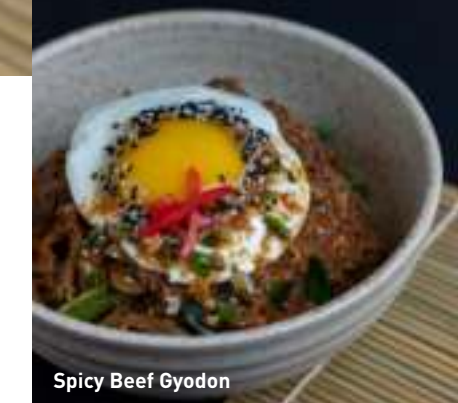
Spicy Beef Gyodon