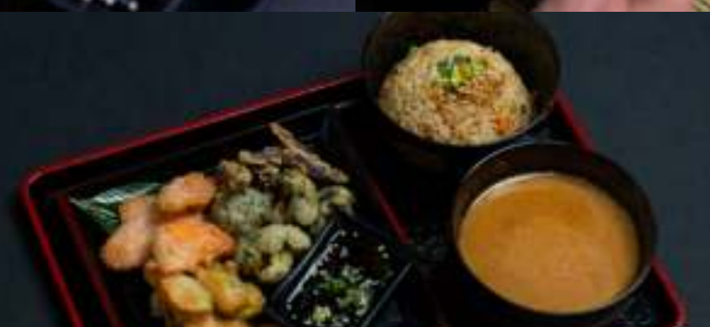
Garden Tempura Rice Set