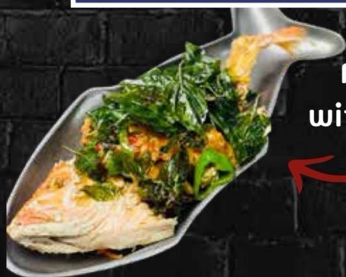
Red snapper with basil sauce