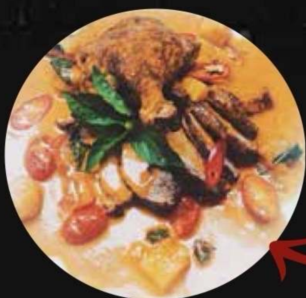
duck pineapple red curry