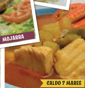
CALDO 7 MARES

For customers who do not order an entrée or share an entrée there will be a $5.99 charge per person for setup.