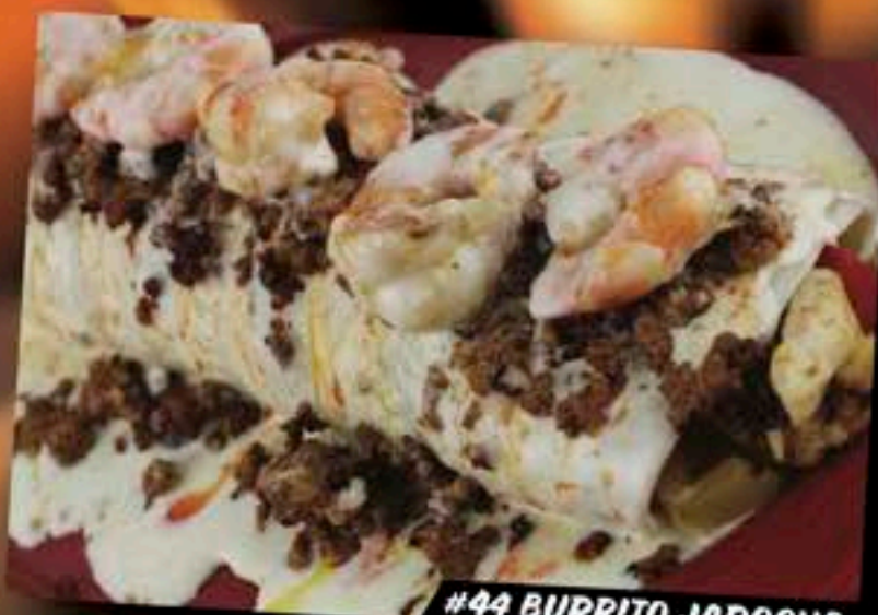
#44 BURRITO JAROCHO