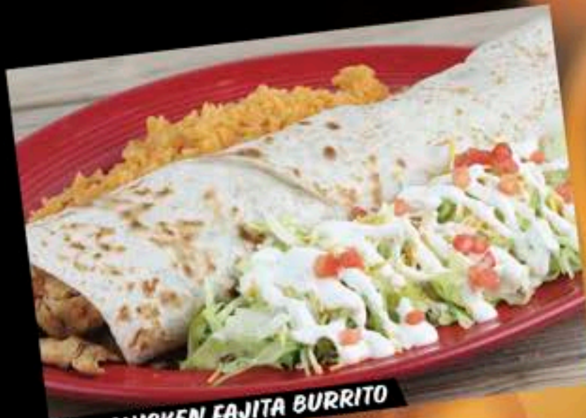
#24 CHICKEN FAJITA BURRITO