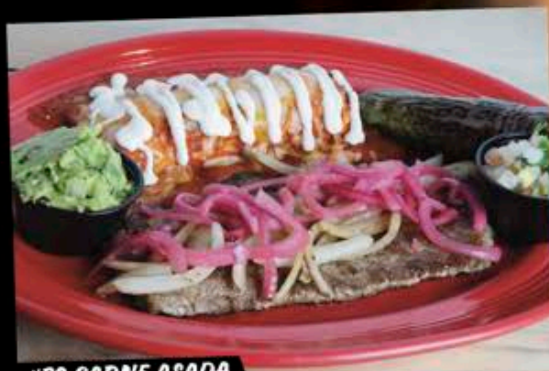
#39 CARNE ASADA