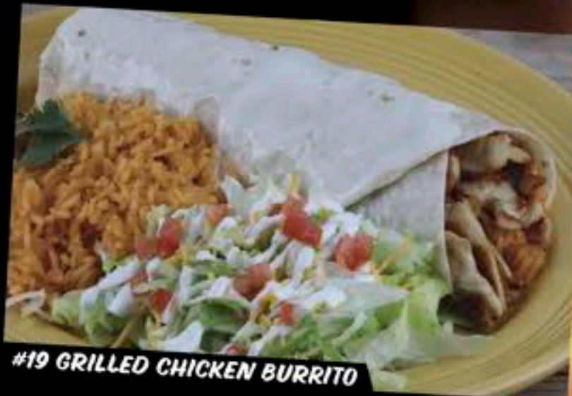
#19 GRILLED CHICKEN BURRITO