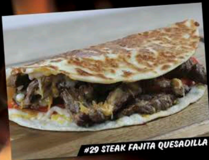
#29 STEAK FAJITA QUESADILLA

Filled with shrimp, grilled onions, tomatoes and bell peppers. Served with rice and salad. 21.00