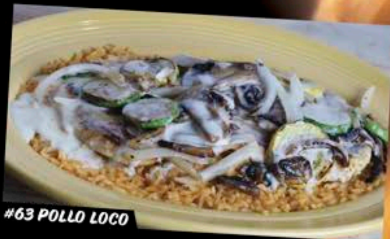
#63 POLLO LOCO