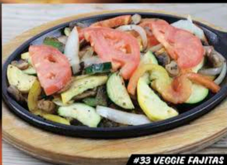
#33 VEGGIE FAJITAS