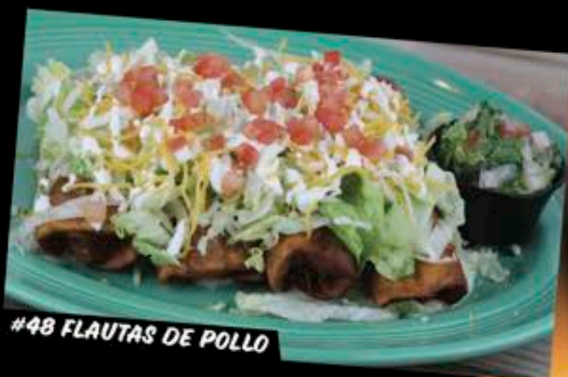
#48 FLAUTAS DE POLLO

Many items will be gluten free if you substitute flour tortillas for corn tortillas. Ask your server for more info. Consuming raw or undercooked meats, poultry, seafood, shellfish or eggs may increase your risk of food-borne illness. Especially if you have certain medical conditions.