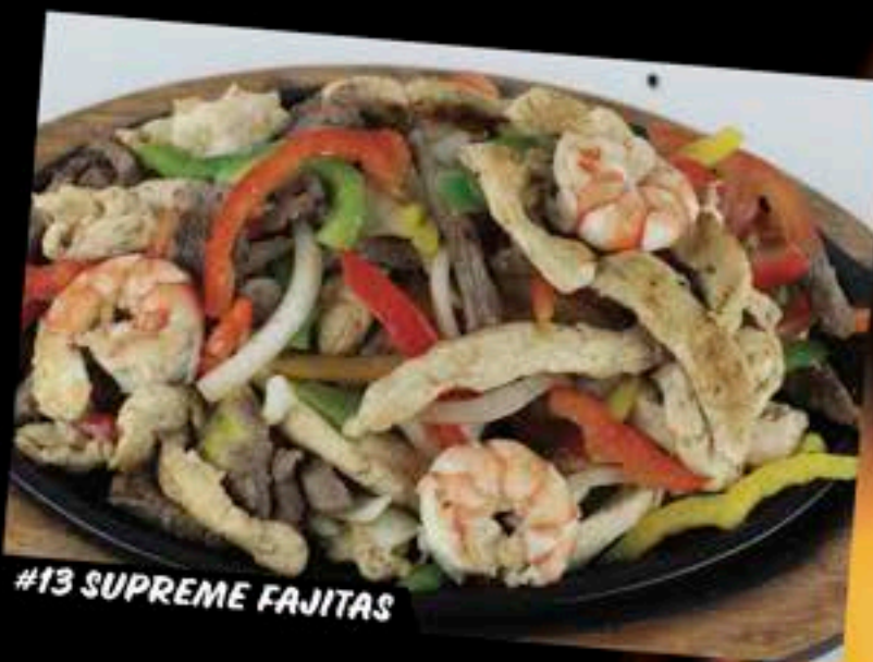
#13 SUPREME FAJITAS

Grilled shrimp cooked with tomatoes, onions and bell peppers. Served on a hot skillet with a side of rice, beans and tortillas. 21.00