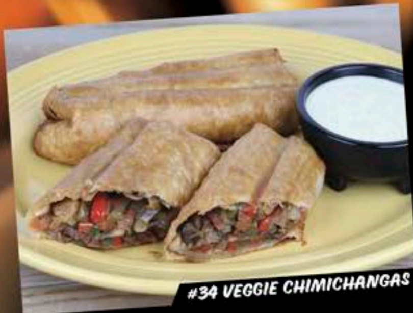
#34 VEGGIE CHIMICHANGAS