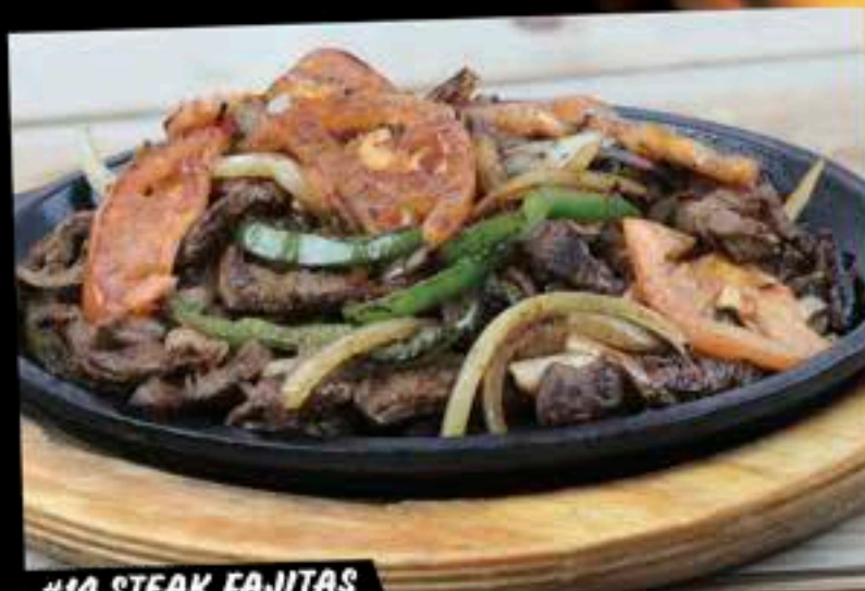
#14 STEAK FAJITAS