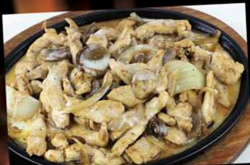
#41 POLLO AZTECA