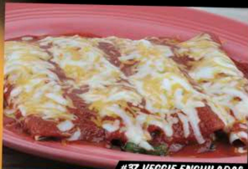
#37 VEGGIE ENCHILADAS