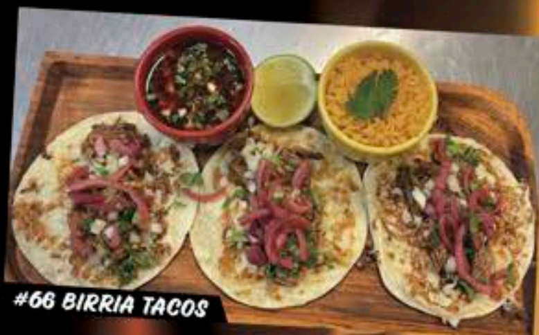
#66 BIRRIA TACOS