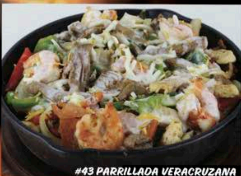
#43 PARRILLADA VERACRUZANA