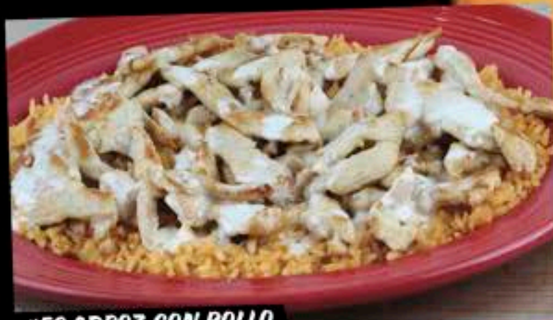
#52 ARROZ CON POLLO