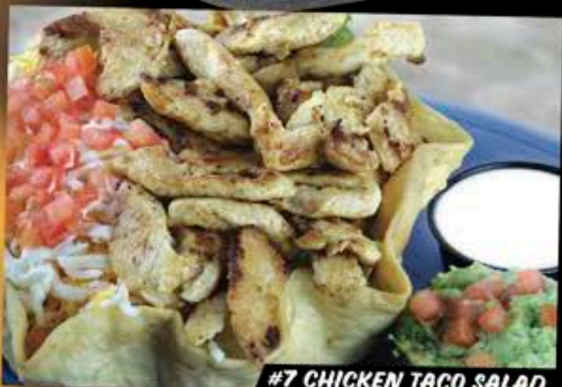
#7 CHICKEN TACO SALAD