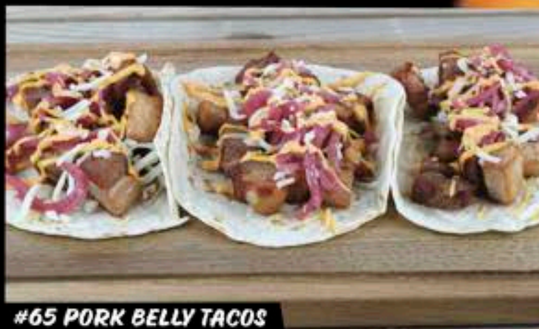
#65 PORK BELLY TACOS