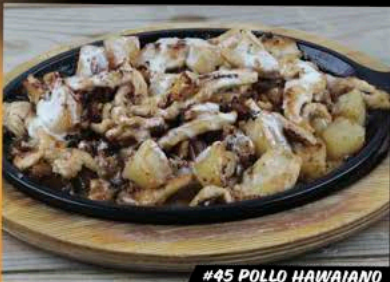
#45 POLLO HAWAIANO